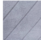
CONCRETE - GREY