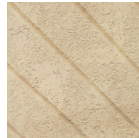
CONCRETE - SAND