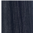
BLACK STAINED OAK